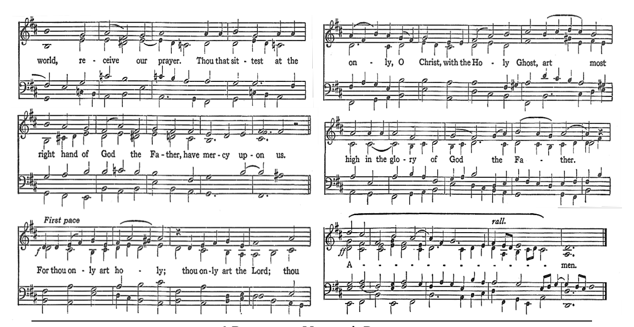
A PRAYER FOR MOTHER'S DAY

\P Mothers that are present are asked to come forward for a blessing and to be recognized.